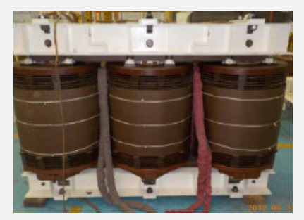
Figure 2. PA after being removed from tank