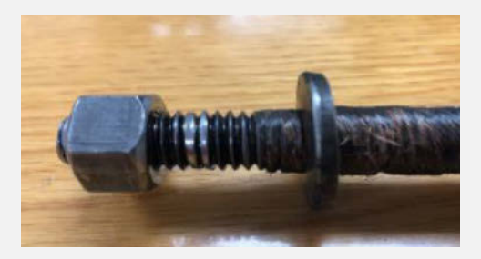
Figure 3: Image of offending bolt/nut assembly showing thread damage